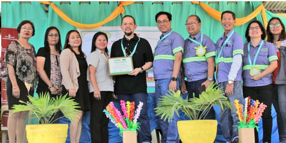
Plaque of Appreciation from Bulacan Agricultural State College for the three-classroom donation by Eagle Cement Corporation EAGLE, in partnership with Philam Foundation, donated three classrooms in Bulacan Agricultural State College which was turned over on 26 May 2017.